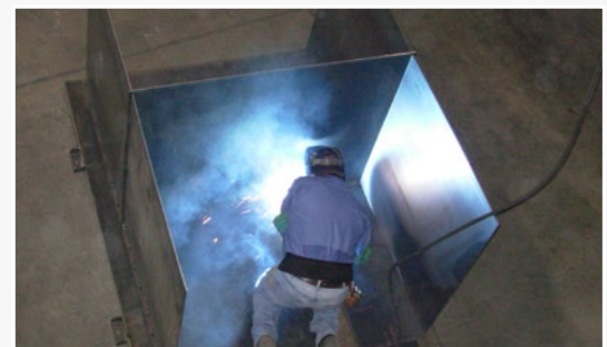
The BenchTop can be designed with custom compartments for multi-purpose use.