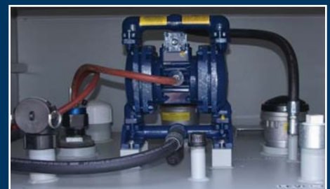
The Kombatank mechanical components are enclosed in an easily accessible compartment.