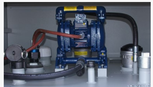
The SafeWaste mechanical components are enclosed in an easily accessible compartment.