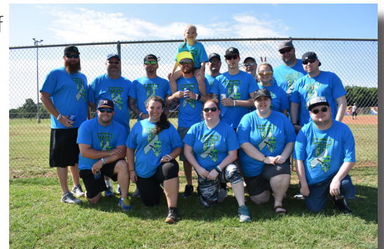
Team Turtle 2018

“We have been honored to have met some true champions in the fight against childhood cancer. The Spirit Teams have become like one big family as well as all of those with Derricks & Diamonds that make this weekend so very special every year.”