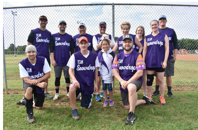
Team Snowdrop 2018