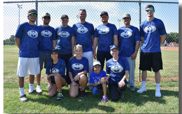
Team Batman 2018